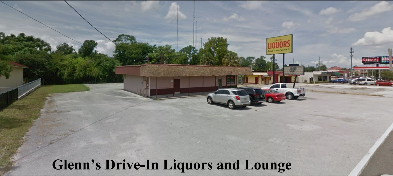
Glenn's Drive-In Liquors and Lounge